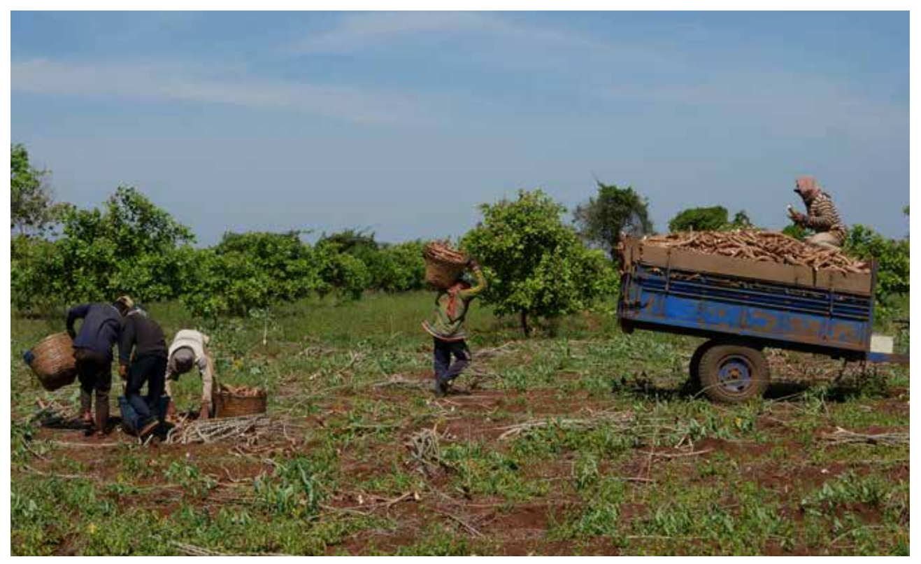
Biosecurity is a significant cross-border challenge and drives regional collaboration. In the Mekong region, plant diseases such as cassava mosaic disease and cassava witches' broom have spread across borders, causing regional economical impact. An ACIAR-supported project in Cambodia, Laos, Myanmar and Vietnam works to establish sustainable solutions to cassava diseases. ACIAR project: AGB/2018/172.

Another research collaboration focusing on plant biosecurity engages the whole of the Mekong Region (Cambodia, Laos, Myanmar, Thailand and Vietnam), and includes China. Cassava production in the Mekong Region is a commercial activity. The crop is cultivated to meet the rapidly growing regional and global demand for animal feed, starch-based products, ethanol and biofuel, and there is significant cross-border trade in planting and raw materials. Two serious diseases are spreading in the region through the movement of infected stems, with secondary infection via invertebrate vectors. The ACIAR project consists of a multipronged strategy involving breeding, surveillance, agronomy and seed systems interventions, coupled with engagement with government institutions and agribusiness.