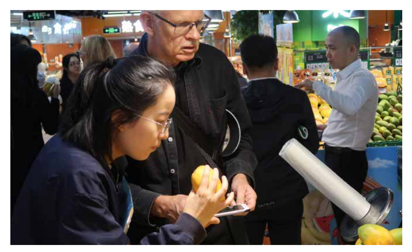
A detailed study of horticultural markets in China is part of a broader project to design practical horticulture marketing policy reforms in Pakistan. ACIAR project: ADP/2014/043.

Fusarium wilt (Panama disease) has affected banana crops in many countries in the world and is a potential theme for trilateral collaboration between Australia, China and another partner country. CATAS, together with Guangdong Academy of Agricultural Sciences and the International Tropical Fruits Network, is planning to host an international workshop on Fusarium wilt in late 2020 or early 2021. At this time, ACIAR will take the opportunity to discuss potential cooperation on Fusarium wilt with CATAS and Guangdong Academy of Agricultural Sciences.