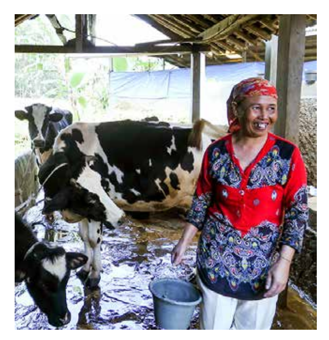
ACIAR is supporting a project that is encouraging the development of the dairy sector in west Java and north Sumatra. ACIAR project: AGB/2012/099.

Smallholder farmers in South-East Asia often cannot access credit to invest in new crops or technologies, deal with risks and shocks, and safely carry wealth from harvest to planting. To help smallholders reach their production potential, a project led by Dr Alan de Brauw of the International Food Policy Research Institute will review and research financing models for agricultural value chains and evaluate specific interventions in Indonesia, Myanmar and Vietnam. Based on evaluation of agricultural value-chain financing models, the project will work with project partners to design and implement innovative and inclusive models.<sup>6</sup>