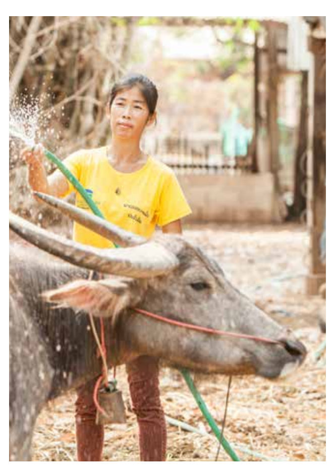
Enterprise diversification is a benefit of increased mechanisation of rice farming.