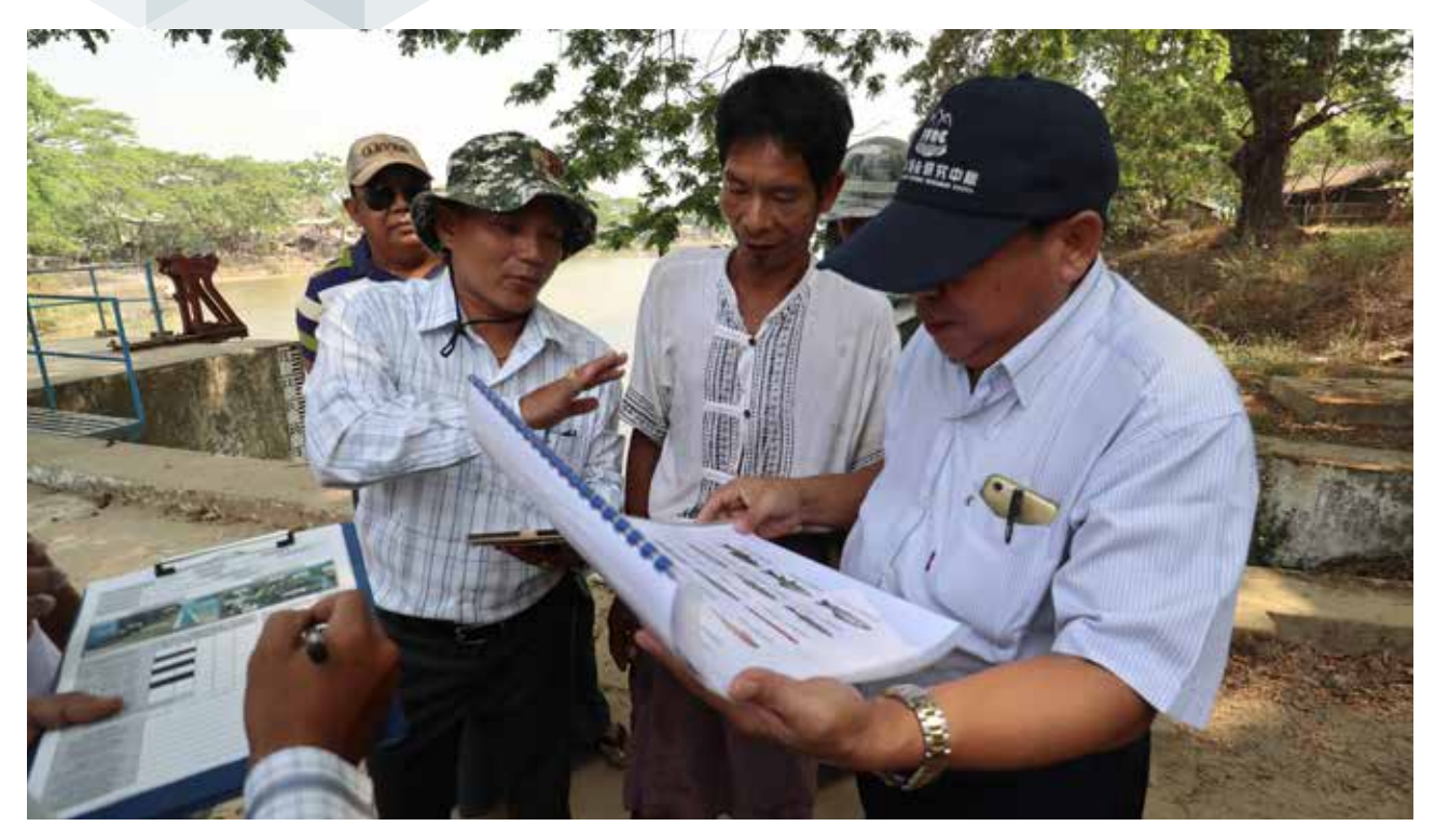
Fisheries and irrigation experts in the field, assessing river barriers and speaking with fisherfolk about changes in fish populations and other observations due to barriers in waterways. The survey precedes the installation of fishways (ladders) to restore migratory fish communities. ACIAR project: FIS/2014/041.