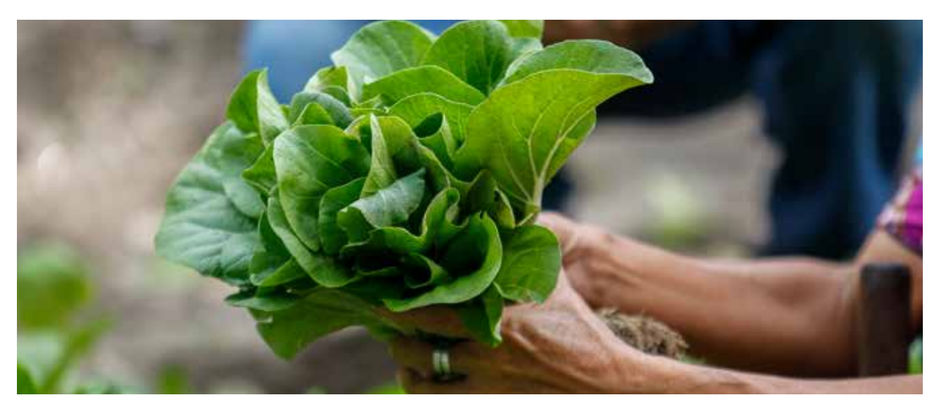
Improving the performance of smallholder value chains for fruit and vegetables and building community capacity through learning alliances is the focus of a project in the southern Philippines. ACIAR project: AGB/2017/039.