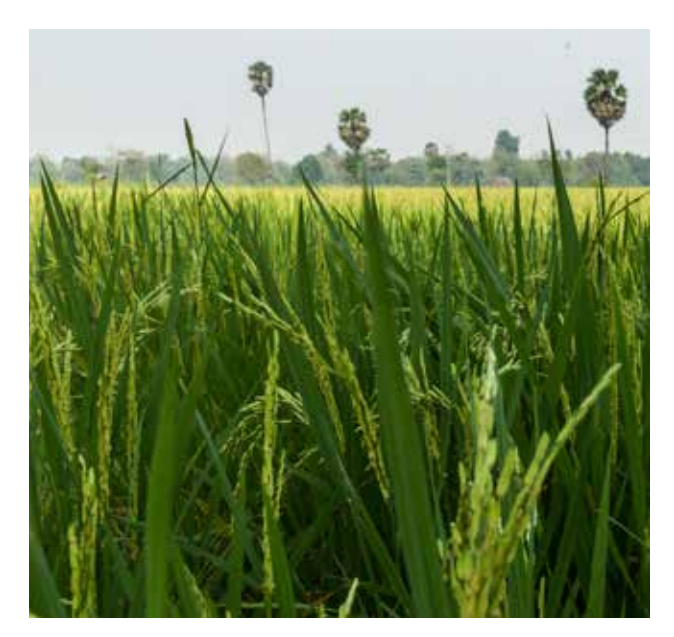
New weed control options will enable rice farmers to adopt and benefit from mechanisation, and sustainable intensification and conservation agriculture practices. ACIAR project: CROP/2019/145.