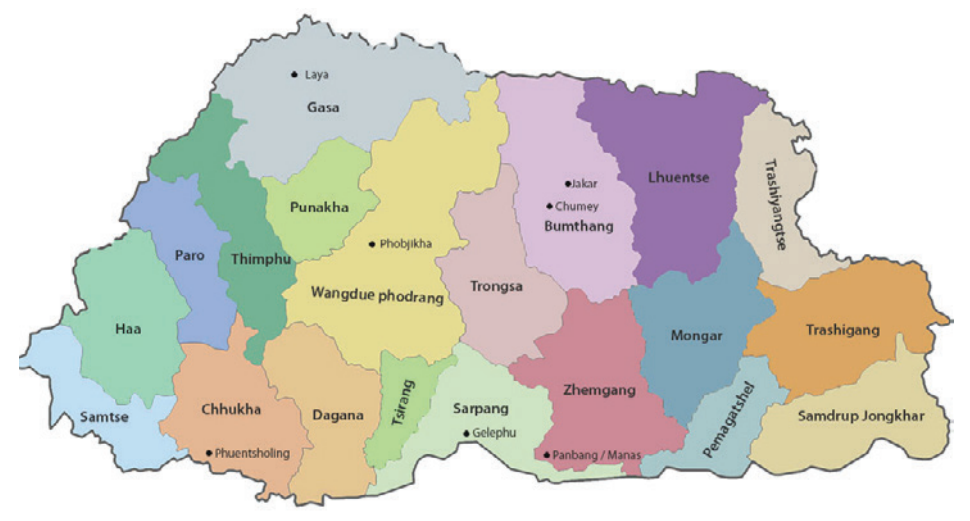
Figure 8: Map of Bhutan showing administrative districts

Tree mulching, irrigation and the application of plant-protection chemicals received little support. Many growers resisted applying plant protection chemicals for religious reasons—Bhutanese Buddhists of strong faith are reluctant to harm any living creature.